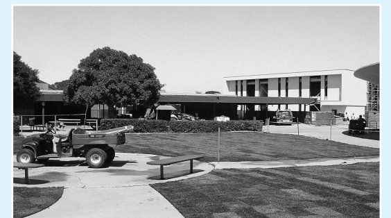
Top: Construction of the new practice gymnasium and band room at Palos Verdes Peninsula High School. Bottom: The beautiful quad at Peninsula High following the plumbing modernization project completed over the summer.